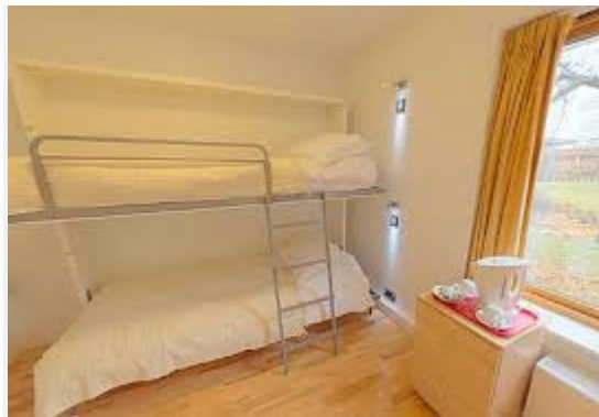
The accommodation at Margam

The centre itself was designed by the Welsh School of Architects, and is a state of the art low carbon foot print building. The park land boasts an Iron Age Hill fort, 12 Century Cistercian Abbey remains, Margam Abbey Church, a Celtic Stones Museum and a beautiful 18th Century Orangery.